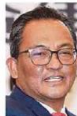
Datuk Ahmad 'Asri Abdul Hamid

Page 1 pic: Medical frontliners taking swab samples from foreign construction workers for Covid-19 testing during the Socso Prihatin Screening Programme at the CIDB Convention Centre in Kuala Lumpur yesterday.