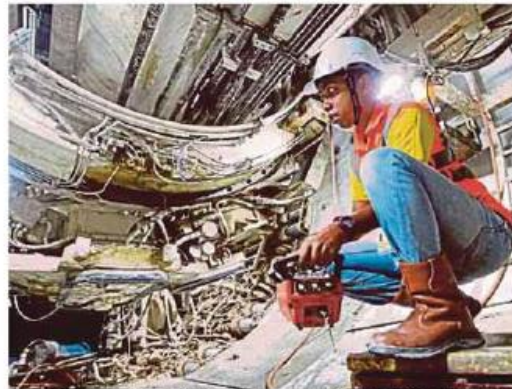
A worker at a Mass Rail Transit construction site in Kuala Lumpur last year. FILE PIC

duced by the government to ease the burden of industry players included subsidising Covid-19 screening of workers, who are Socso contributors.