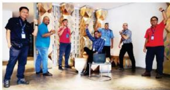
Clockwise from top. The rule of social distancing was not forgotten by S P Setia's team who watched the virtual event at the Setia Eco Hill Welcome Centre; UEM Sunrise staff cheered when the results were announced; SDB Property Management's team celebrates when Windows on the Park won Gold of the EdgeProp-ILAM Malaysia's Sustainable Landscape Award 2020.