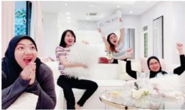
Team EcoWorld watching the live of the EdgeProp Malaysia's Best Managed and Sustainable Property Awards 2020 at the show house @ Eco Spring in Iskandar Malaysia, Johor.