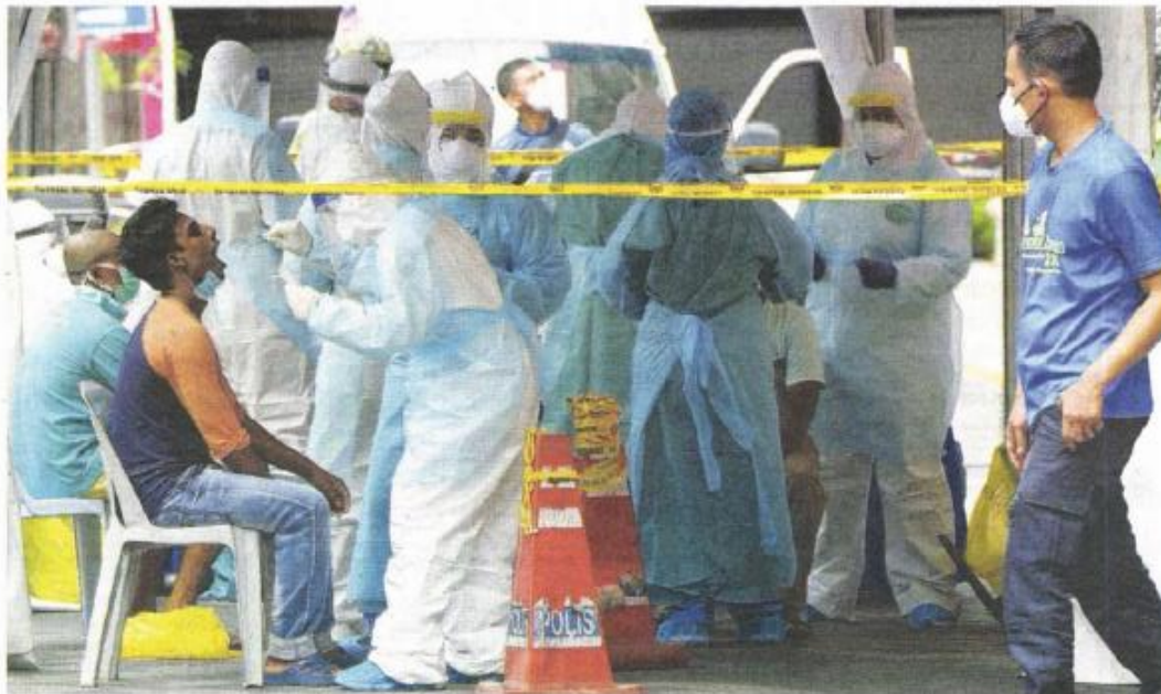
TEST, TEST, TEST: Health Ministry staff screening for Covid-19 among Selangor Mansion and Malayan Mansion residents after the govt imposed EMCO following 15 positive cases there. Ismail Sabri says foreign embassies are responsible for providing the necessary essentials including food for their citizens living at Selangor Mansion dan Malayan Mansion, as 97% of the estimated 6,000 residents of both buildings are foreigners.